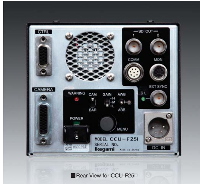
■ Rear View for CCU-F25i